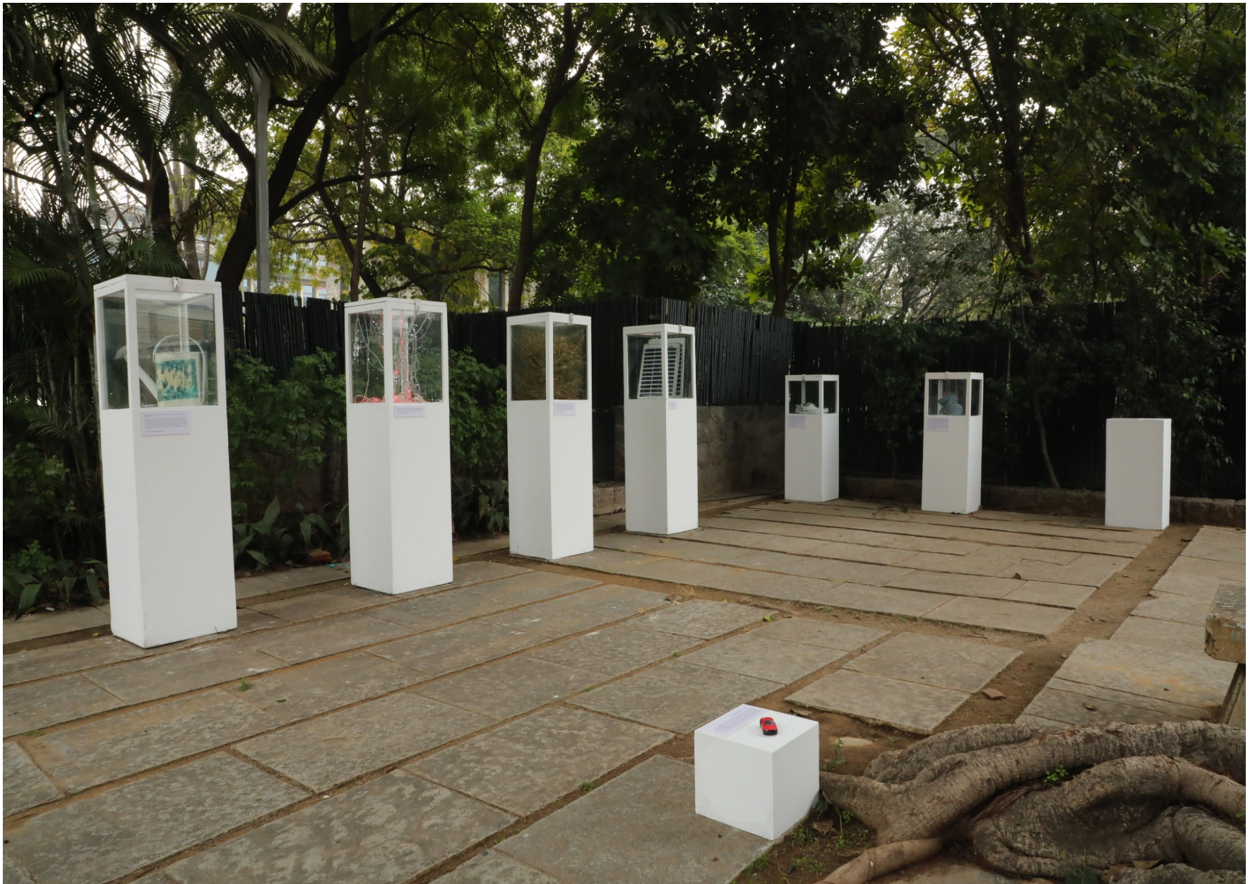
Achia Anzi, Artist's Breath