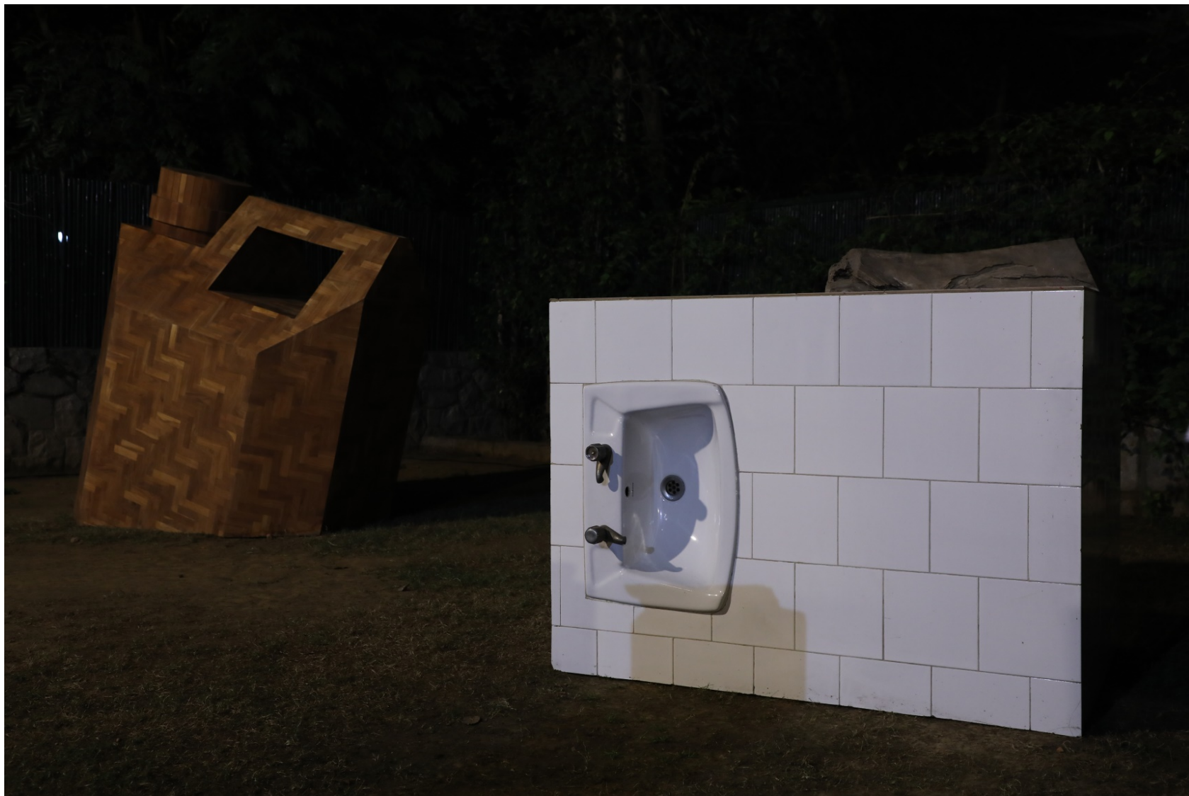
ATUL BHALLA, Untitled (Piau I)