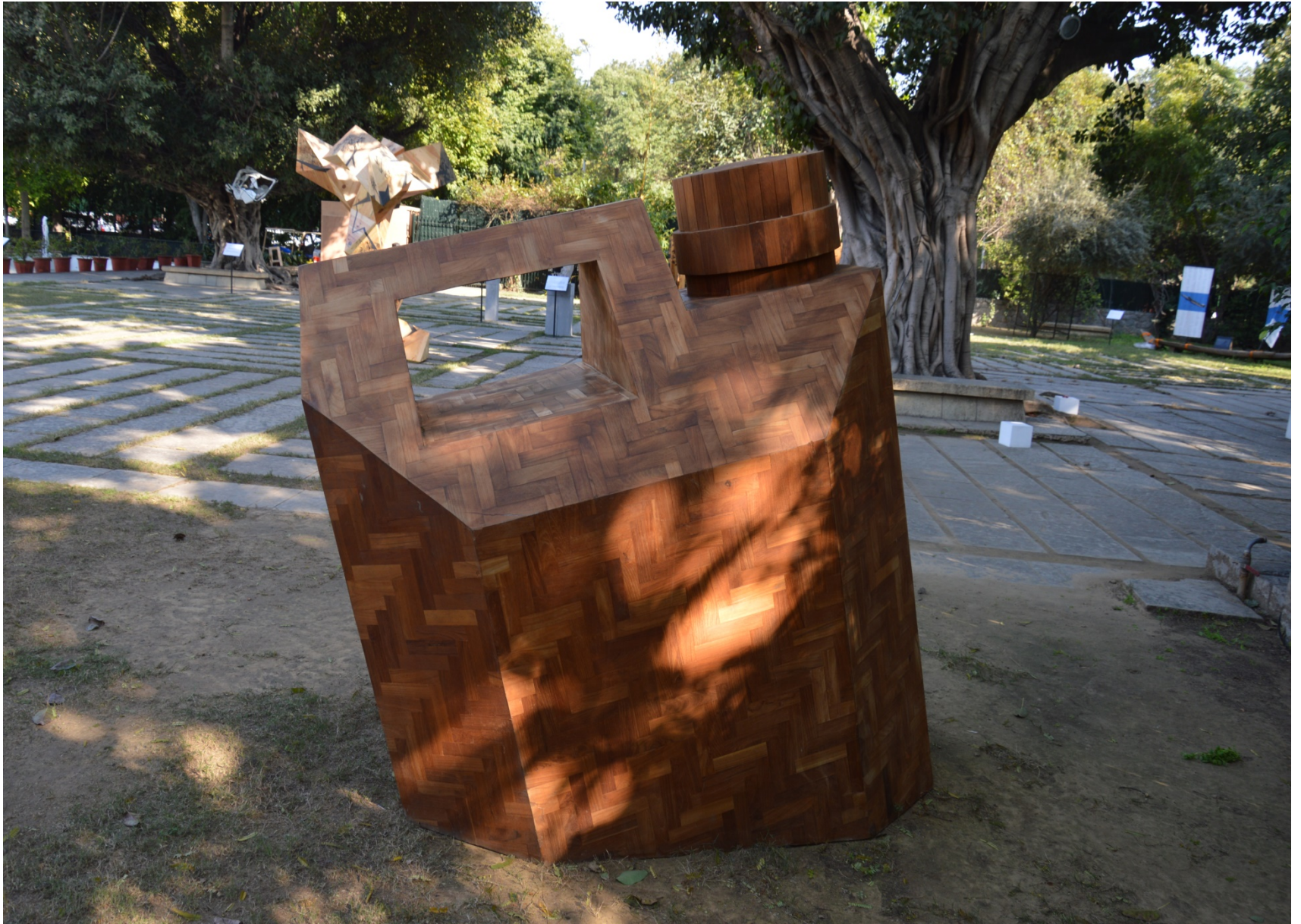
ATUL BHALLA, Untitled (Nothing Reached Home)