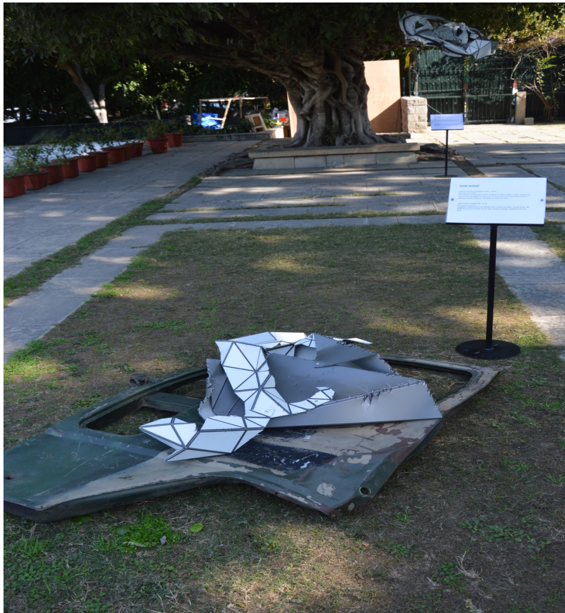
ASIM WAQIF , Collapse analysis: Vehicle Factory Jabalpur Door 2019