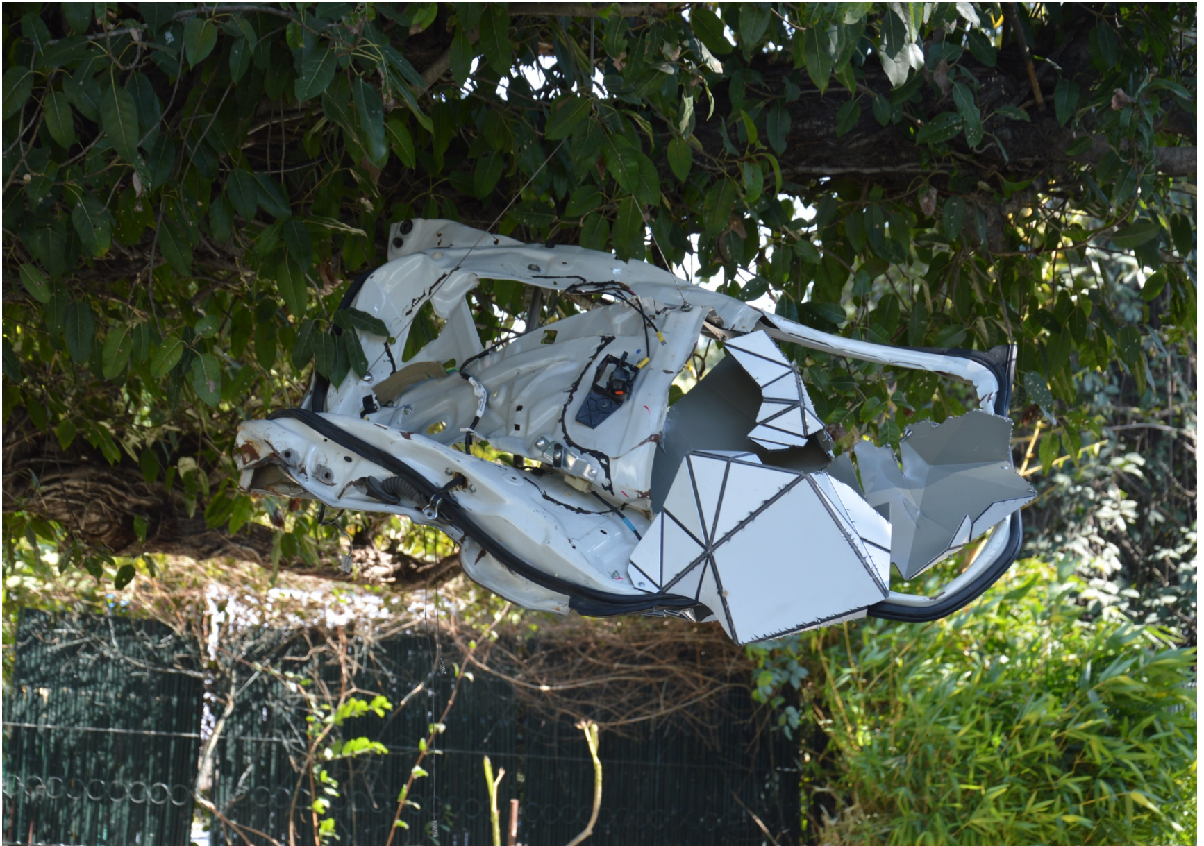
ASIM WAQIF , Collapse analysis: Mayapuri 2019