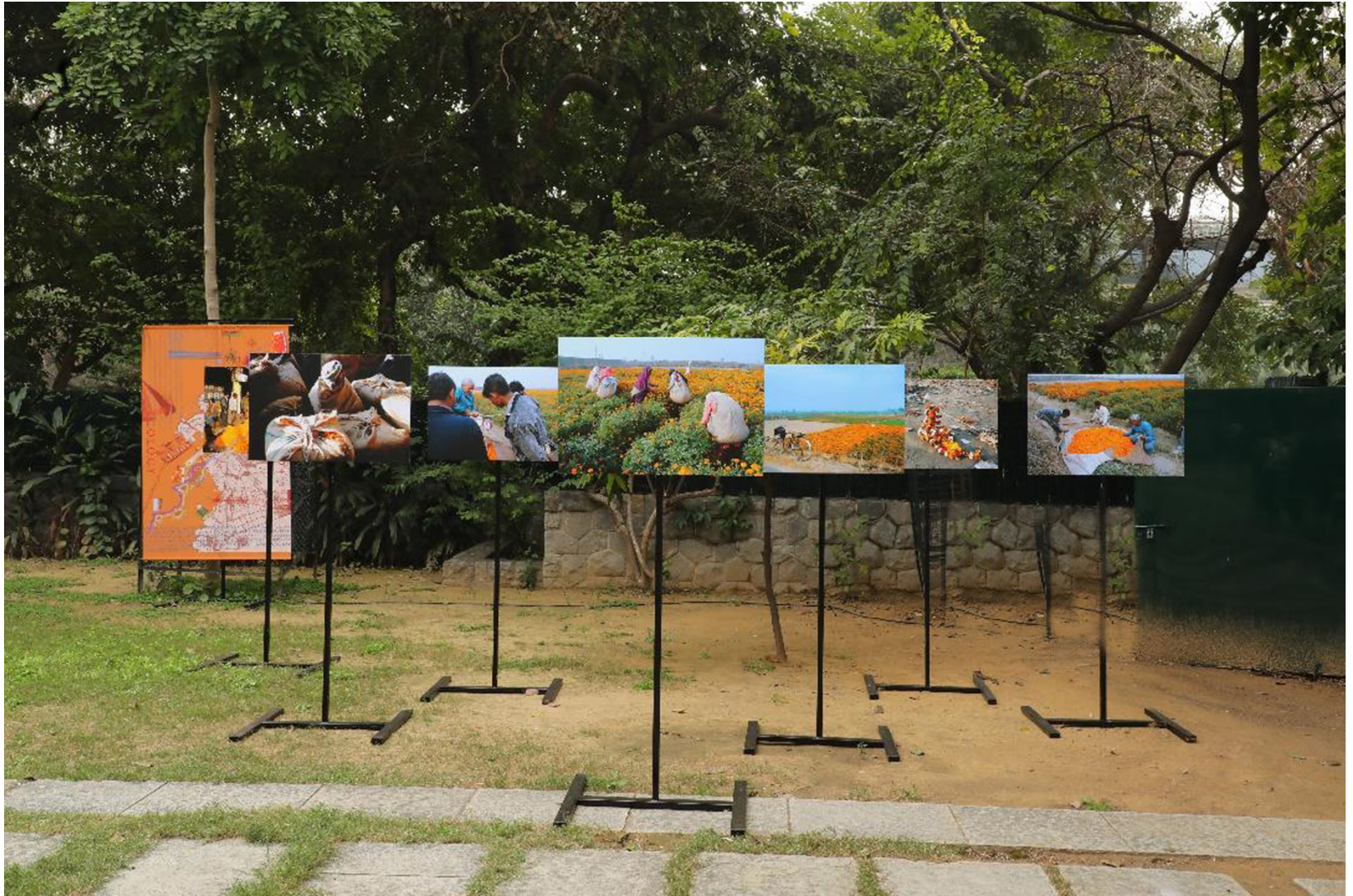
RAVI AGARWAL , Have you seen the flowers on the river?